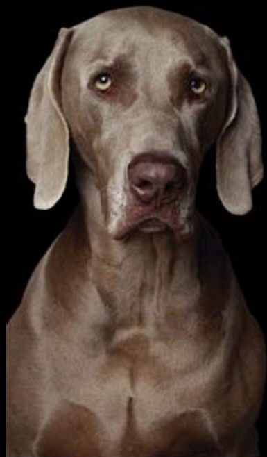
THE DIABETIC WEIMAREINER

In 1988, veterinarians at the University of California at Davis reported on 13 dogs that had been eating a generic dry, corn and wheat-based dog food. The dogs were depressed and lethargic. They had swollen lymph nodes and, worst of all, they had scaly, crusting areas where their fur was falling out. The dog food the owners were feeding did not state that it met minimum nutritional requirements (AAFCO). When the animals were put on a higher-quality dog food, the animals began to get better within days.