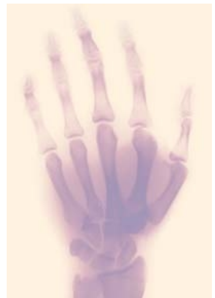
How SAME fights arthritis

found that the prevalence of osteoarthritis skyrockets to as much as 90% for people over 75 years of age. 13 At present, the primary treatment options available through conventional medicine are limited - aspirin, steroids, COX-2 inhibitors and nonsteroidal anti-inflammatory (NSAIDs) drugs. While these medications effectively ease pain, they do not reverse the joint cartilage damage. Furthermore, NSAIDs and even the newer COX-2 inhibitors are commonly associated with serious side effects such as intestinal disorders and ulcers. 14 Clearly, more effective treatment options are sorely needed.