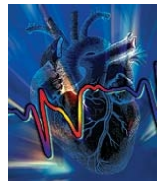
Heart Disease: Cholesterol molecules slip into the lining of coronary arteries and are engulfed by cells called macrophages. Eventually, a plaque forms. The stronger the inflammatory reaction, the more likely the plaque will burst, causing a heart attack or stroke