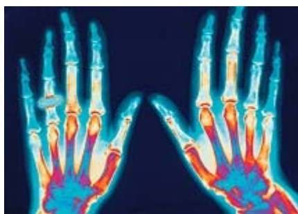
Rheumatoid Arthritis: Something—possibly a viral infection—provokes macrophages and neutrophils to attack the joints. The skeleton becomes increasingly deformed

There's just one problem with that explanation: sometimes it's dead wrong. Indeed, half of all heart attacks occur in people with normal cholesterol levels. Not only that, as imaging techniques improved, doctors found, much to their surprise, that the most dangerous plaques weren't necessarily all that large. Something that hadn't yet been identified was causing those deposits to burst, triggering massive clots that cut off the coronary blood supply. In the 1990s, Ridker became convinced that some sort of inflammatory reaction was responsible for the bursting plaques, and he set about trying to prove it.