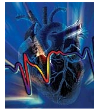
Heart Disease: Cholesterol molecules slip into the lining of coronary arteries and are engulfed by cells called macrophages. Eventually, a plaque forms. The stronger the inflammatory reaction, the more likely the plaque will burst, causing a heart attack or stroke