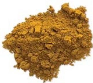
Curcumin is the active compound in turmeric powder.

No cure exists for Alzheimer's, and the drugs currently available to treat the disease address only its symptoms, and with only limited effectiveness. Medical experts believe that therapeutic intervention that could postpone the onset or progression of Alzheimer's—even by as little as two years—would dramatically reduce the number of cases over the next 50 years. 3 A growing body of evidence suggests that a promising therapeutic modality may already be available. This remedy is most commonly found not in a biochemical laboratory, but rather in the kitchen spice rack: the perennial herb known around the world as turmeric.