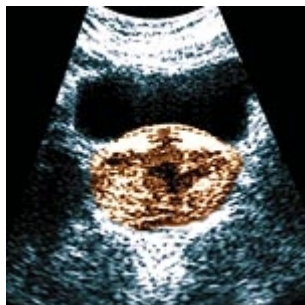
Echogram, axial section: tumor of a patient with prostate cancer.