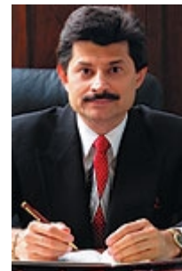
by William Faloon

Until now, PSA has been viewed only as a blood indicator of prostate cancer, infection, or inflammation. Emerging evidence, however, reveals that PSA may be more than just a marker of prostate health. It appears that PSA itself may play a role in the progression and metastasis of prostate cancer, 1-3 thus opening up new therapeutic pathways for preventing and treating this epidemic disease.