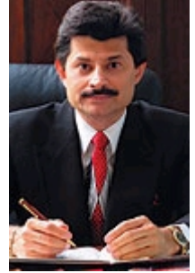
by William Faloon

"Magnesium is needed for more than 300 biochemical reactions in the body. It helps maintain normal muscle and nerve function, keeps heart rhythm steady, supports a healthy immune system, and keeps bones strong. Magnesium also helps regulate blood sugar levels, promotes normal blood pressure, and is known to be involved in energy metabolism and protein synthesis. There is an increased interest in the role of magnesium in preventing and managing disorders such as hypertension, cardiovascular disease, and diabetes." 35