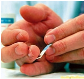
Blood glucose test in diabetes.

Three studies have shown that coffee consumption helps reduce the risk of type II diabetes. In an analysis of more than 17,000 Dutch men and women, the more coffee a person drank, the lower the incidence of diabetes. Consuming three to four cups a day decreased the risk by 23%, while persons drinking more than seven cups daily cut their risk in half. 19