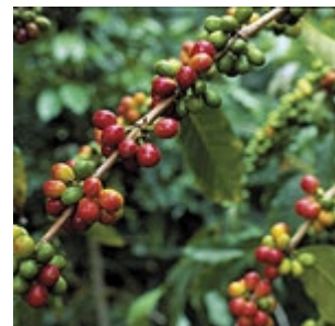
Kona coffee beans growing on tree.

The coffee berry contains some well-studied phytochemicals such as chlorogenic acid, caffeic acid, ferulic acid, and quinic acid. 10 These nutrients have recently been shown to help quench free radicals, 11 provide cardiovascular benefits, 12 and reduce cholesterol oxidation. 13 However, some of coffee berry's most impressive effects can be seen in blood glucose management.