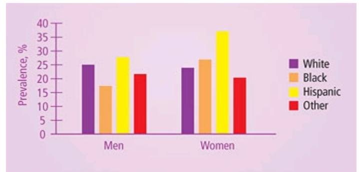
Figure 1: Age-Adjusted Prevalence of Metabolic Syndrome

Metabolic syndrome is a phenotypic expression of the genetic code as it interacts with the environment. Specifically, if you have a genetic tendency to develop the metabolic syndrome phenotype, you will be far more likely to develop this phenotype if you are overweight, do not exercise, consume a diet high in simple sugars and saturated fats, and do not consume enough specific nutrients with beneficial nutrient-gene interactions.