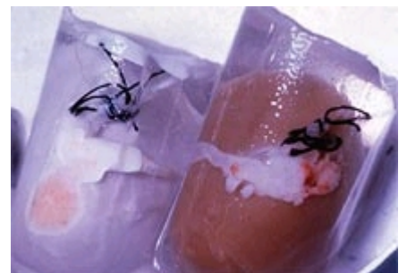
Figure 8. The kidney on the right was vitrified, while the kidney on the left was frozen. There is massive ice formation inside and outside of the frozen kidney, while there is virtually no ice in or on the vitrified kidney, which looks like a natural kidney at normal body temperature. Both kidneys were photographed at -140^{\circ}\text{C} .

At the annual meeting of the Society for Cryobiology in July 2005, Dr. Fahy announced the survival of a rabbit that received a transplanted kidney after the organ had been vitrified to -130^{\circ}\text{C} and then re-warmed. This result was based on the vitrified kidney's ability to provide sole renal life support in the recipient animal until it was removed for examination 48 days after it was transplanted. The transplanted kidney sustained some damage from ice formation in its center, but that damage was entirely absent in other parts of the core of the kidney, enabling the organ to support life in a normal fashion.