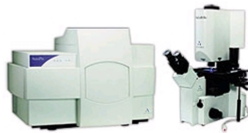
Figure 6. Arcturus Veritas™ Automated Laser Capture Microdissection and Laser Cutting System.