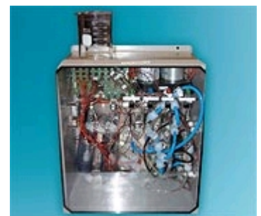
Figure 7. Portable liquid ventilation system used by CCR.

For several years, CCR worked with an engineering firm to place its lavage equipment into a prototype portable system. This required a redesign and computerization of the system's first pump module, which originally weighed more than 100 lbs. The design eventually was reduced to a double-chamber piston system, which weighed less than 35 lbs. and was small enough to be carried in one hand with a strap. This system needed to be gas powered from a small pressure tank, and also required a vacuum source. Another CCR invention is portable heat exchangers made from pre-frozen "ice cartridges," which work by routing fluorocarbon through fine tubes immersed in ice. With this system, the amount of ice needed for adequate cooling of a 45-lb. dog was reduced to only 8 lbs. CCR continues to conduct dog experiments with this system. (Fig. 7.)