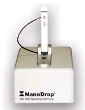
Figure 5. NanoDrop® ND-1000A UV/Vis Spectrophotometer.