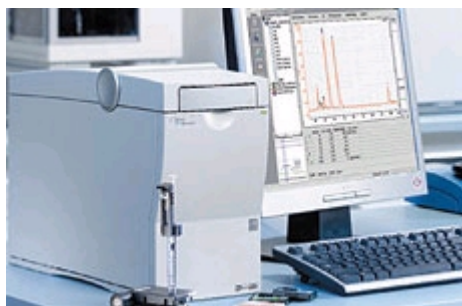
Figure 4. Agilent 2100 Bioanalyzer.