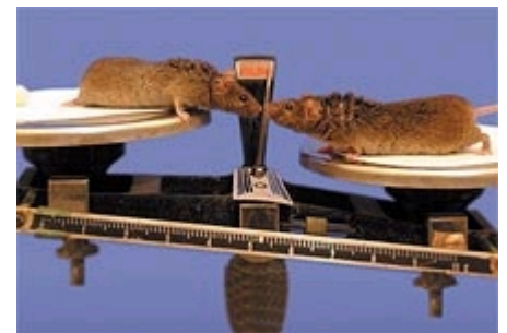
Figure 3. The mouse on the left has been on a calorie-restricted diet and is lighter, healthier, and more youthful in appearance and behavior than his normally fed counterpart. Both mice are 20 months of age.

At advanced ages, calorie-restricted animals are thinner, smaller, and more youthful looking than normally fed animals. The most striking difference between CR and normally fed animals is their activity level. Thirty-month-old, normally fed mice, which are roughly equivalent to 80-year-old humans, are sluggish, bloated, and often have malignant tumors. By contrast, 30-month-old CR mice exercise vigorously, often in acrobatic fashion, and are highly inquisitive. (Fig. 3.)