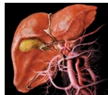
Interior view of the liver, gallbladder, and associated vessels

Consumption of hydrogenated and saturated fats has well-known adverse effects on blood lipid profiles. The hydrogenation of fats produces a hydrogenated form of vitamin K called dihydrophyloquinone, which is not absorbed as well as unsaturated (normal) vitamin K and also appears to be ineffective in promoting bone production. 54 These data further support avoiding foods that contain saturated fat and supplementing with vitamin K when a diet high in saturated fat cannot be avoided.