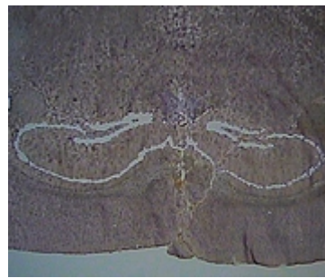
Mouse brain section, stained, before cell harvesting.