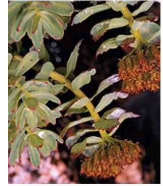
Rhodiola rosea seed heads

Multiple studies from the former Soviet Union have demonstrated Rhodiola's effectiveness in combating both physically and psychologically stressful conditions. One study in particular demonstrated Rhodiola's amazing ability to significantly reduce stress in a single dose. This study was unique in that it examined the effects of a single-dose application of adaptogens for use in situations that require a rapid response to tension or to a stressful situation. They found that Rhodiola was extremely effective in controlling stress generated by the part of the stress system known as the sympathoadrenal system. This is significant because, as the study points out, the traditional stimulant drugs used for controlling this stress have the potential to become addictive. Users often develop a tolerance, making it necessary for them to take larger and larger doses of the drug. This behavior can easily lead to unintentional drug abuse, have a negative effect on sleep structure, and cause rebound hypersomnolence or come-down effects. Not only does Rhodiola produce no negative side effects, but it also effectively increases both mental and physical performance.