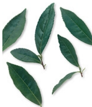
Green tea leaves

Although the term polyphenol refers to a class of food-derived chemicals containing a polyhydroxyphenol group, it has been adopted to broadly describe any botanical or herbal agent with antioxidant properties. Historical evidence and epidemiological studies were the first to suggest the potential anti-cancer benefit of drinking green tea for reducing breast, colon, and prostate cancer incidence. 19-23 The most common green tea plant is Camellia sinensis , and the major active ingredients of green tea are thought to be the catechins.