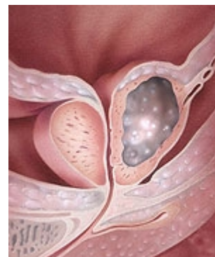
Prostate tumor confined to prostate gland.

In sum, these important findings suggest that pomegranate may help prevent the occurrence of prostate cancer, while slowing the growth and spread of existing prostate cancers.