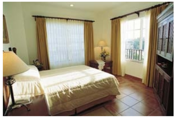
Spacious units, which are called villas, feature balconies, marble floors and generous closet space

Surrounded by the natural beauty of the ocean, beaches and tropical foliage, Royal Resorts has had a long-standing commitment to live in harmony with nature while protecting its delicate balance. Conservation of natural resources is practiced in a host of different ways. Trash is separated and recycled and wastewater is reused to water the landscaping. Royal Resorts sponsors a turtle protection program where nests are guarded and hatchlings are released by company volunteers. In fact, no product may be sold in a Royal Resorts shop involving an endangered species or contributing to destruction of natural rain forests. To minimize the use of pesticides, hardy, pest-resistant plants have been used as much as possible.